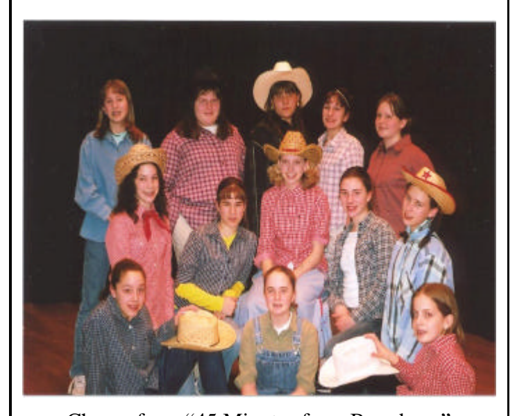
Chorus from "45 Minutes from Broadway"

Congratulations to the 6th graders for producing outstanding pieces of work!!